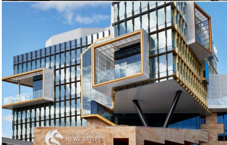
Lyons' not so uniform approach to design