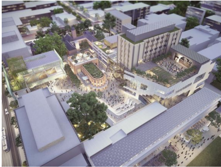
Lyons' depiction of University of Melbourne's new $229m student precinct

The $229 million project will see Lyons head an expanded design team which includes United States-based Koning Eizenberg Architects, Aspect Studios, Breathe Architecture, NMBW Architecture Studio, Greenaway Architects, Glas Urban and Architects EAT.