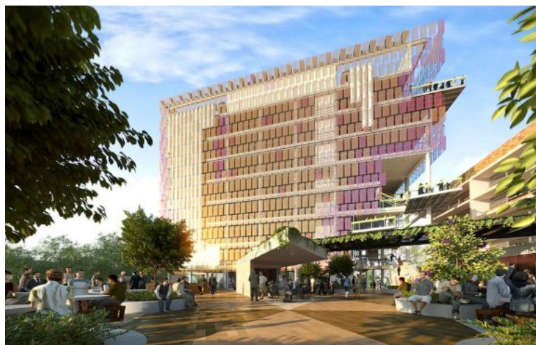
University of Queensland's newest addition.

At University of Queensland's St Lucia campus, Liveris Academy is yet another project which showcases Lyons' uncommon design traits.