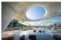
Home game: Parklands