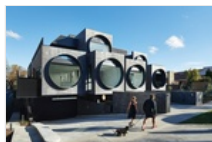
All-round suburban: Cirqua Apartments