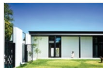
Kindred spirit: Belmont House