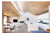
Subtle luxury: The Villa at Barwon Heads