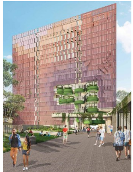
PHOTO: The Liveris Academy will seek to support young leaders of a sustainable future.

Mr Liveris raised concerns when Mr Trump withdrew from the Paris Accord, saying it was important to have a seat at the table as the world headed toward lower carbon emissions, but he said he also understood governments needed time to transition to affordable sustainable energy solutions.