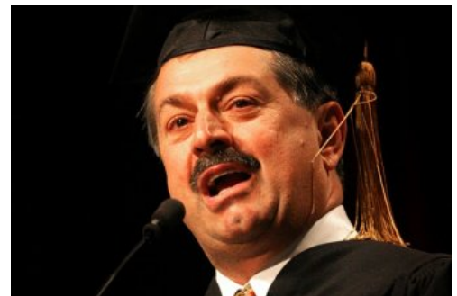
PHOTO: Andrew Liveris said the business world and governments had to work together.

"Business people need to embrace it so we can help governments come up with affordable trajectories and runways to get to this better place where we have lower temperatures, lower emissions," he said.